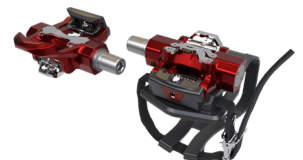
Morse Taper Triple Link™ Delta-compatible pedals

Core Health & Fitness is more than gym equipment, we offer innovative solutions for all your facility needs. This is why we've brought together five of the most recognizable fitness brands to ensure our customers can offer their members authentic fitness experiences. Whether working with us directly or through our partners and distributors worldwide, we provide the highest quality equipment backed by a service and support team that will always go the extra mile to get you what you need, when you need it. Partner with us and see how our Core Values motivate our every decision.