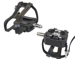
Standard Morse Taper Double Link™ pedals