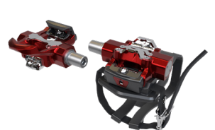
Morse Taper Triple Link™ Delta-compatible pedals

Core Health & Fitness is more than gym equipment, we offer innovative solutions for all your facility needs. This is why we've brought together five of the most recognizable fitness brands to ensure our customers can offer their members authentic fitness experiences. Whether working with us directly or through our partners and distributors worldwide, we provide the highest quality equipment backed by a service and support team that will always go the extra mile to get you what you need, when you need it. Partner with us and see how our Core Values motivate our every decision.