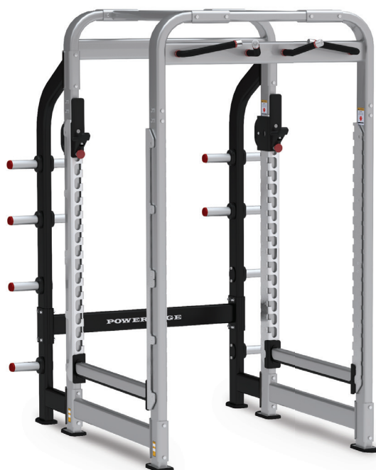
POWER CAGE NP-R8005