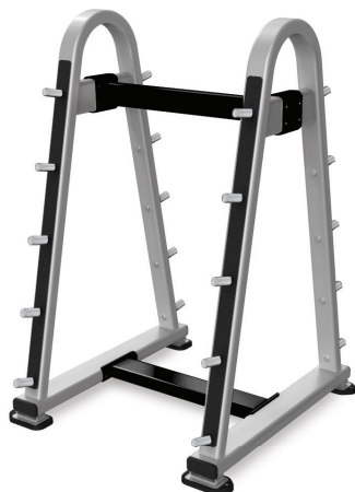
BARBELL RACK NP-R8012