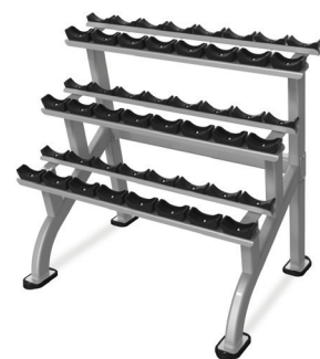
BEAUTY BELL RACK NP-R8014