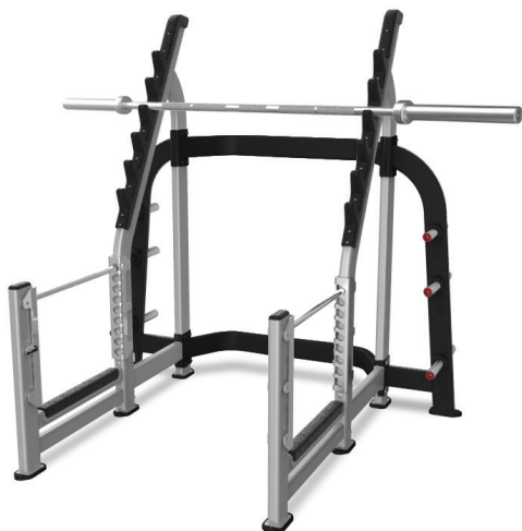
SQUAT RACK NP-R8008