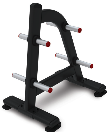
2-SIDED OLYMPIC WEIGHT TREE NP-R7512