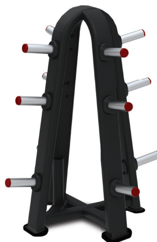
4-SIDED OLYMPIC WEIGHT TREE NP-R7513