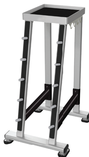
ACCESSORY RACK NP-R8013