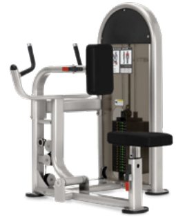
VERTICAL ROW 9NL-S3320