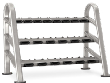
DUMBBELL RACK 10-PAIR/3 TIER 9NN-R8002