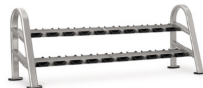
DUMBBELL RACK 10-PAIR/2 TIER 9NN-R8001