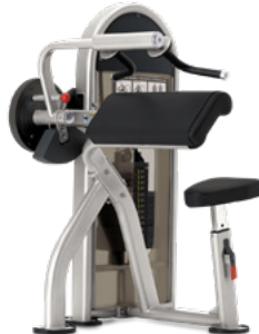
DUAL BICEPS CURL/TRICEPS EXTENSION 9NL-D5120