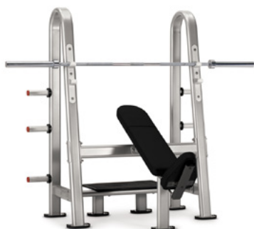
OLYMPIC INCLINE BENCH 9NN-B7201