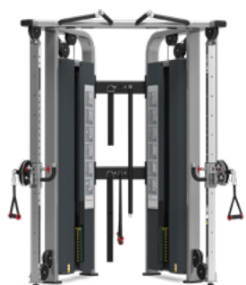
DUAL ADJUSTABLE PULLEY 9NL-D2002