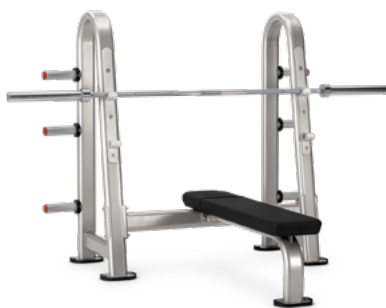
OLYMPIC FLAT BENCH 9NN-B7503