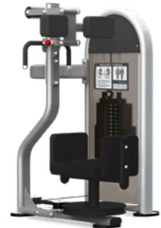
ROTARY TORSO 9NL-S6300