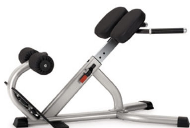
45 DEGREE BACK EXTENSION 9NN-B7502