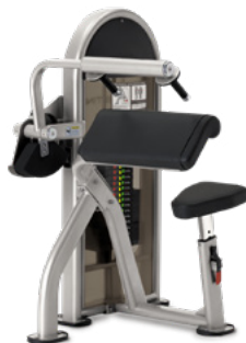
TRICEPS EXTENSION 9NL-S5110