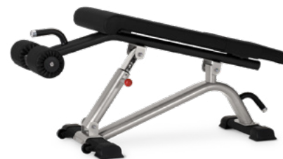
ADJUSTABLE ABDOMINAL DECLINE BENCH 9NN-B7200