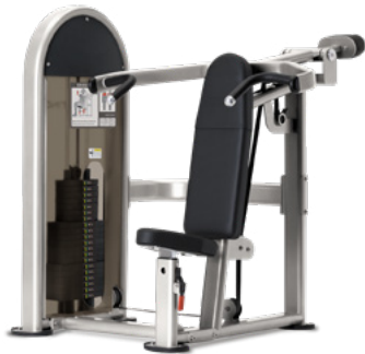
SHOULDER PRESS 9NL-S4100