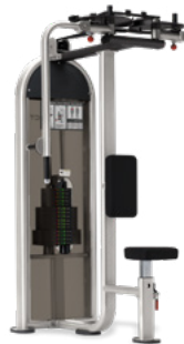
DUAL PECTORAL FLY/REAR DELTOID 9NL-D2110