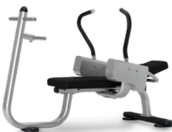
AB BENCH 9NN-B7505