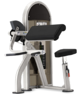
BICEPS CURL 9NL-S5100