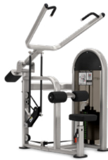
LAT PULL DOWN 9NL-S3310