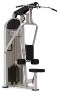
DUAL LAT PULL DOWN/VERTICAL ROW 9NL-D3340